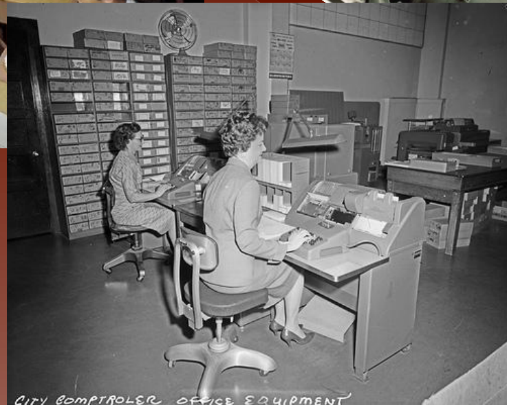
CITY COMPTROLLER OFFICE EQUIPMENT